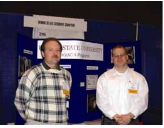
the public about the various programs at the college.

The Ferris booth gave those in attendance the opportunity to discuss the various programs and training available through the HVACR program at the University. This is the third year that the University and the students have participated in the Expo, informing